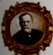
2022: Bicentenary of Louis Pasteur's Birth