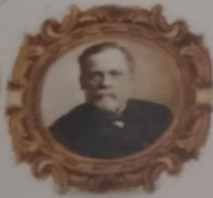
2022: Bicentenary of Louis Pasteur's Birth