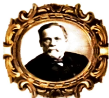
2022: Bicentenary of Louis Pasteur's Birth