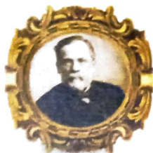
2022: Bicentenary of Louis Pasteur's Birth