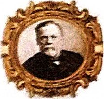
2022: Bicentenary of Louis Pasteur's Birth