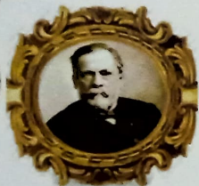
2022: Bicentenary of Louis Pasteur's Birth