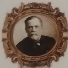
2022: Bicentenary of Louis Pasteur's Birth